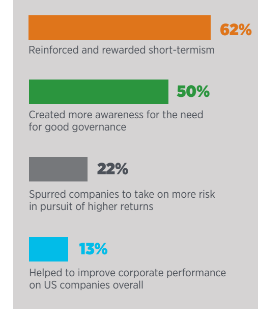
FIGURE 9 CONSEQUENCES OF THE RECENT WAVE OF HEDGE FUND ACTIVISM

engagement as the be-all strategy to transparency, placing an emphasis on quality over quantity, including knowing your shareholder base, a criteria about which, as our survey indicates, the great majority of directors (86%) believe their board has a good to excellent understanding.